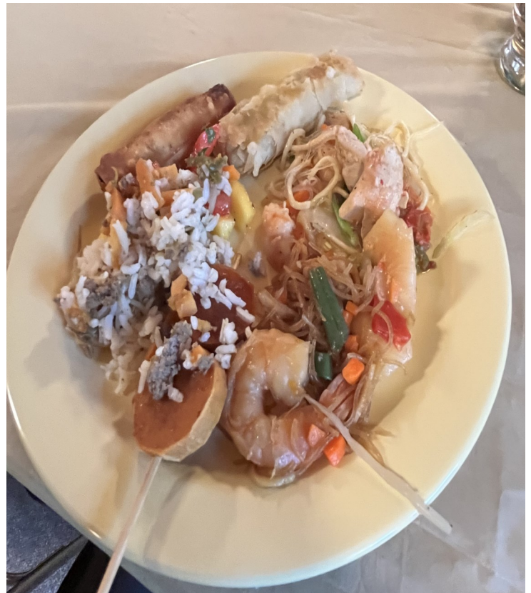
A Dish from the Philippines